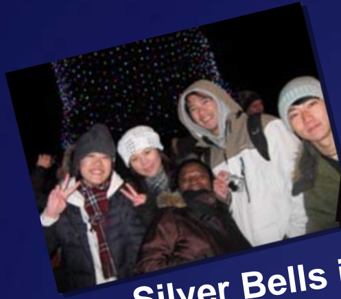
Silver Bells in the City