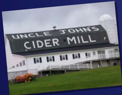
Uncle John's Cider Mill